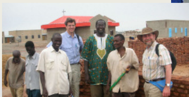
Virginia has replaced the old clinic in Renk with a new one, made of brick and owned by the church.