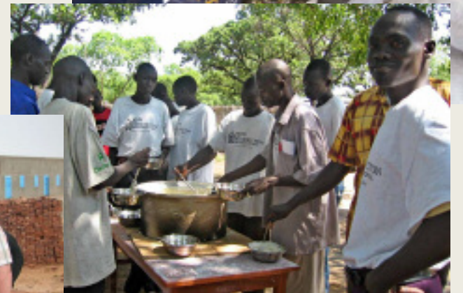
School lunch at Hope and Resurrection School.