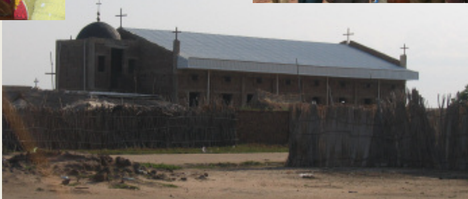
Stone on stone -- Cathedral rises in Sudan thanks to friends in Virginia.